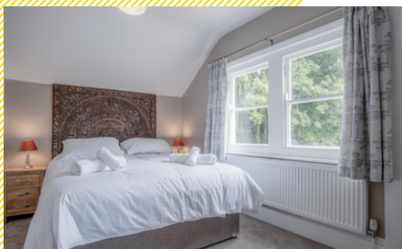
New Building – Bedroom 5 King bedroom with shared bathroom with a bath and overhead shower. This room is the main access for room 6 too. Good for sharing with a friend. £500