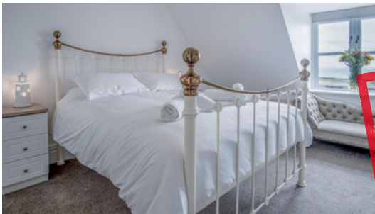
Top floor – Bedroom 3 King bedroom with en-suite offering bath with handheld shower. Sea View £625