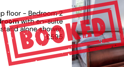
Top floor – Bedroom 2 King bedroom with en-suite offering a stand alone shower. £595